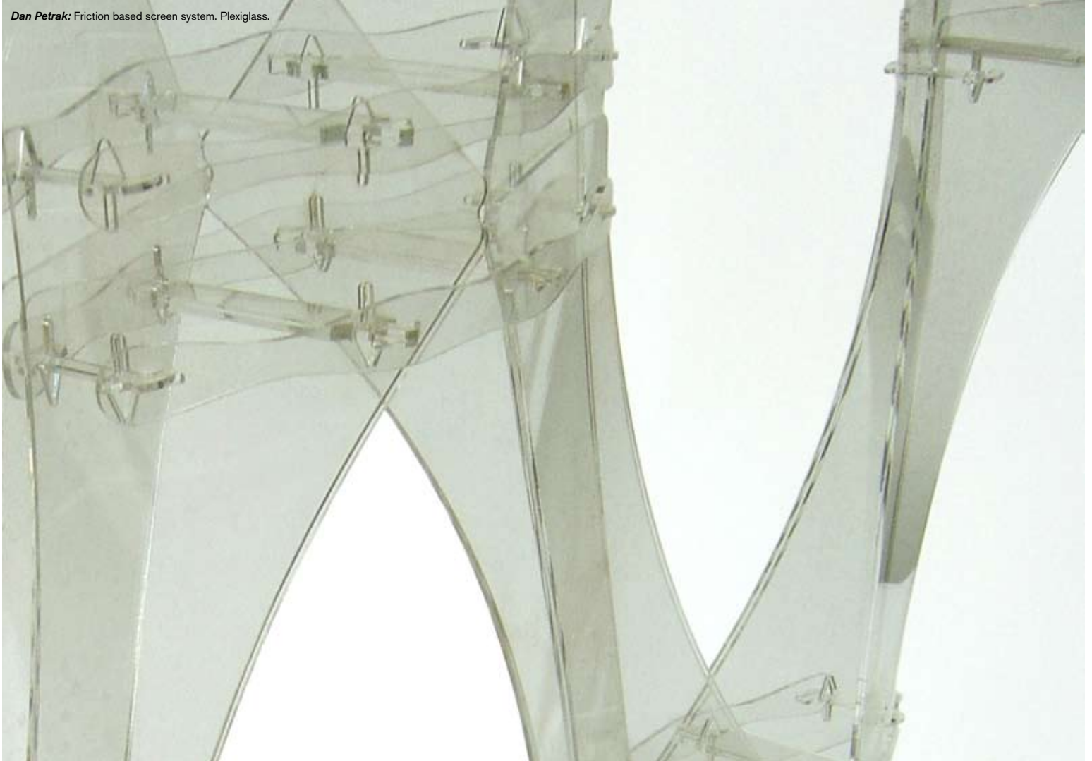
Dan Petrak: Friction based screen system. Plexiglass.